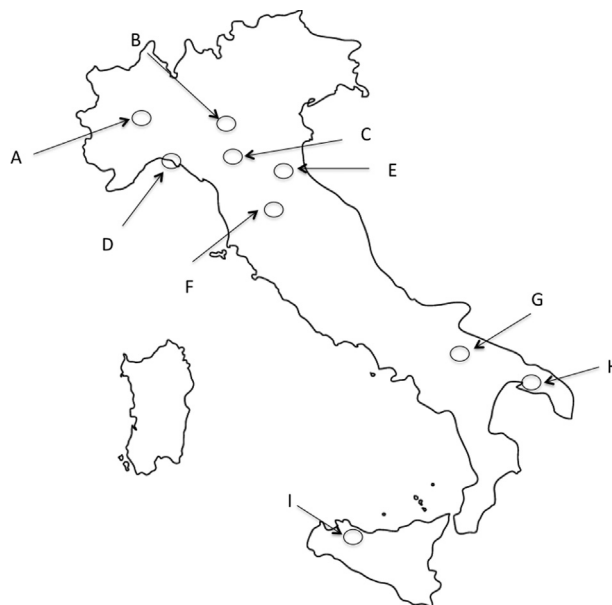
Figure 1. GVM Care & Research cardiac units, geographic distribution and calendar year 2013-2014 raw mortality and number of cases—(A) (Piemonte), 4.6%, n = 351 ; (B) (Emilia Romagna), 1.2%, n = 27 ; (C) (Emilia Romagna), 0.9%, n = 343 ; (D) (Liguria), 4.3%, n = 392 ; (E) (Emilia Romagna), 2.3%, n = 922 ; (F) (Tuscany), 1.9% n = 368 ; (G) (Puglia), 2.6%, n = 637 ; (H) (Puglia), 1.6%, n = 483 ; and (I) (Sicily), 4.1%, n = 318 . (Color version of figure is available online.)

EWMA chart parameters and Six-Sigma (SS) level.